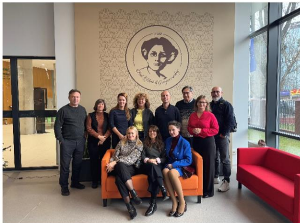
Kick-Off Meeting in Warsaw

Together, we are collaborating to create effective educational tools and teacher training programs to improve social and emotional development support for children with ASD.