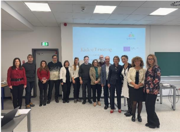
Kick-Off Meeting in Warsaw